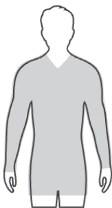
TAILORED / SLIM FIT

Tapered through the chest, shoulders and waist for a slim fit.